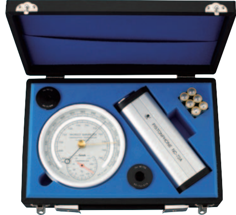
Carrying case (supplied)

NC-72A is designed to generate sound that has a sound pressure level of 114 dB(nominal) at 101.325 kPa of atmospheric pressure. Depending on the barometric pressure, the unit may need compensation. For this purpose, a barometer is supplied with the unit.